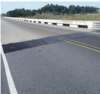
Bridge Deck Approach