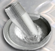
Crafcro Applicator Disk