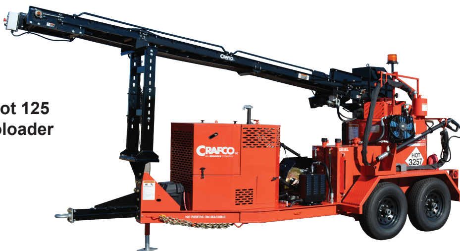
Super Shot 125 with Autoloader

The patented pump technology of the Crafcro Super Shot melters is what makes the Super Shot the most productive and lowest maintenance melter in the industry. The Crafcro patented pump is mounted inside the sealant tank. Mounting the pump inside eliminates material recirculation, outside plumbing, and high-pressure lines, while decreasing pump wear. The Super Shot pump will last many times longer than a conventional pump. Internal pumps require no packing which eliminates maintenance and results in more production on the job.