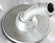
Crafcro Swivel Applicator