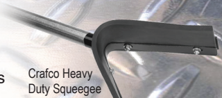
Crafcro Heavy Duty Squeegee

Use for leveling crack sealant and where a sealant over band is recommended.