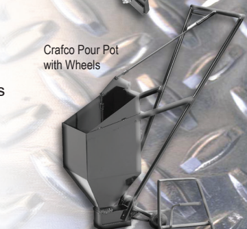
Crafcro Pour Pot with Wheels

Use to apply a uniform band of sealant to a crack or joint. Wheeled for ease of use. Gravity feed with shut off lever.