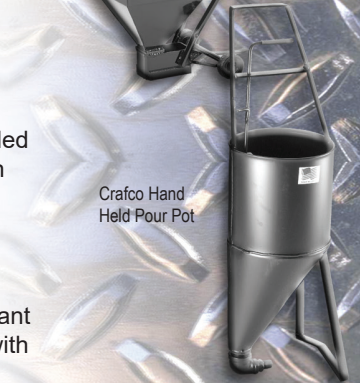
Crafcro Hand Held Pour Pot

For application of thin crack sealant to a joint or crack. Gravity feed with shut off lever.