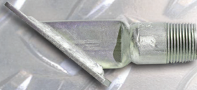
Crafcro Sealing Foot / Flush

Use with Super Shot Melter wands to prevent dripping of material.