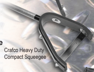
Crafcro Heavy Duty Compact Squeegee

Use for leveling crack sealant and where a sealant over band is recommended.