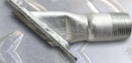
Crafcro Sealing Foot / Protruded

PN# 27155 Sealing tip/ft assembly 3/8" flush