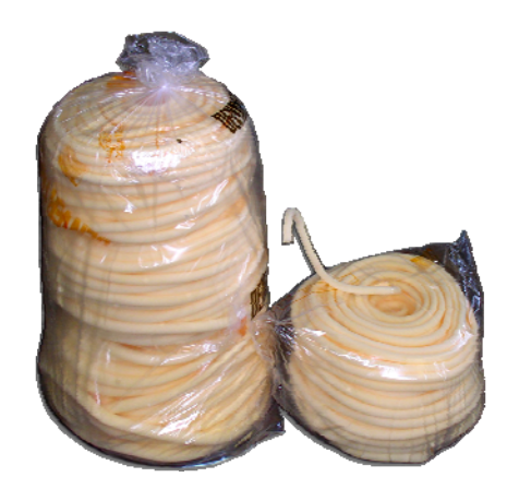
The picture above details how 'bales' are packaged into 'Master Bags'.