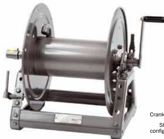
Crank rewind Standard configuration shown